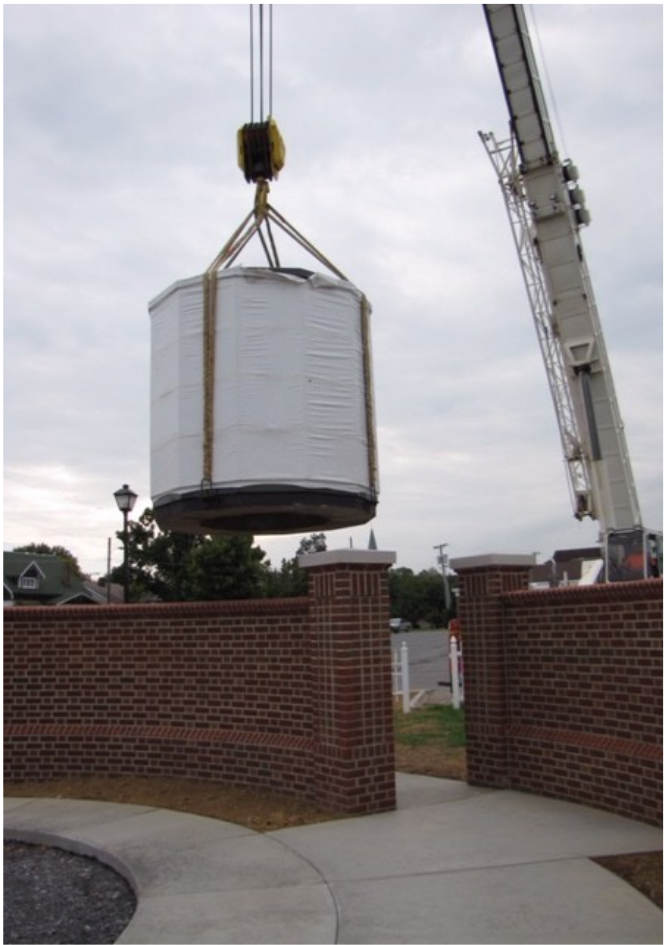
The vault of the columbarium which contains the individual niches is lowered into place