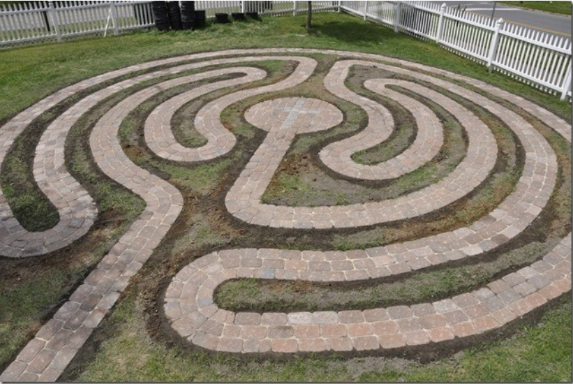
The prayer labyrinth